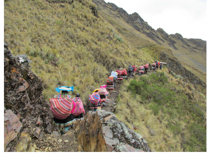
Finally, we reached our destination!