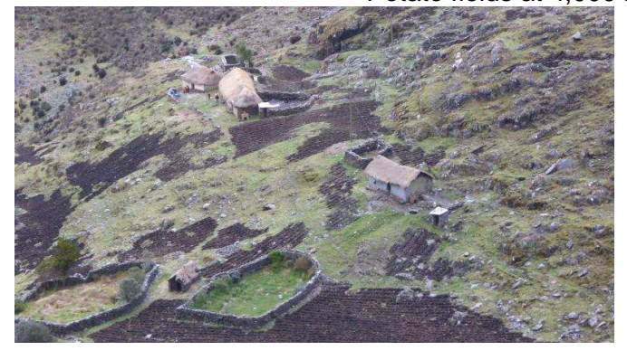
Potato fields at 4.000 metres above sea level

The little village community of Pitukiska lies 4,100 metres above sea level. In these high regions of the Andes, the inhabitants can grow only potatoes. Other vegetables cannot be grown there as the soil is not suitable. In addition, the extreme weather conditions are not ideal for growing vegetables in the open (night frosts, strong UV radiation by day, etc.).