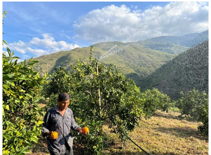
A happy farmer next to one of his five sprinkler systems on his plot.