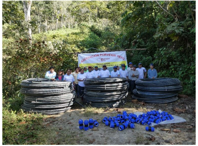
Some of the material is shown on the photograph. Twenty-nine rolls of hose, each 100 metres long are still to arrive.