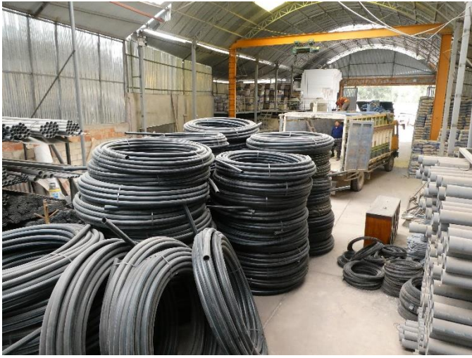
Forty-five rolls of water pipes, each 100 metres long, waiting to be transported.