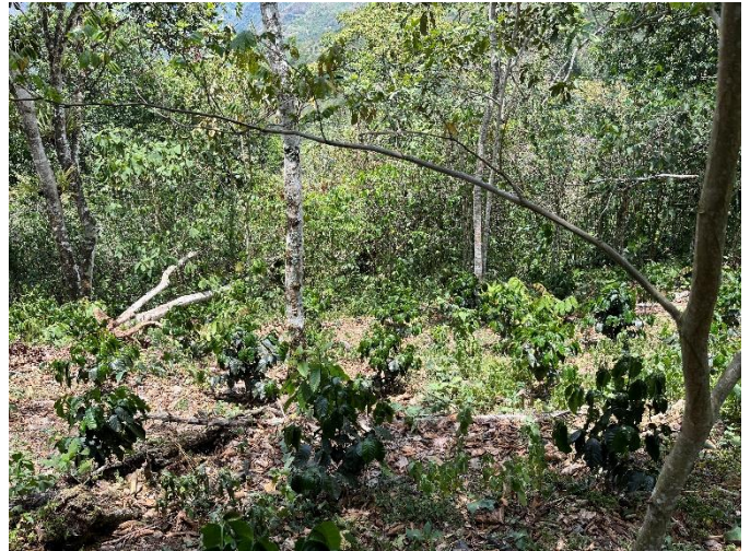
The pipes also had to be buried in impassable terrain to take the shortest route.