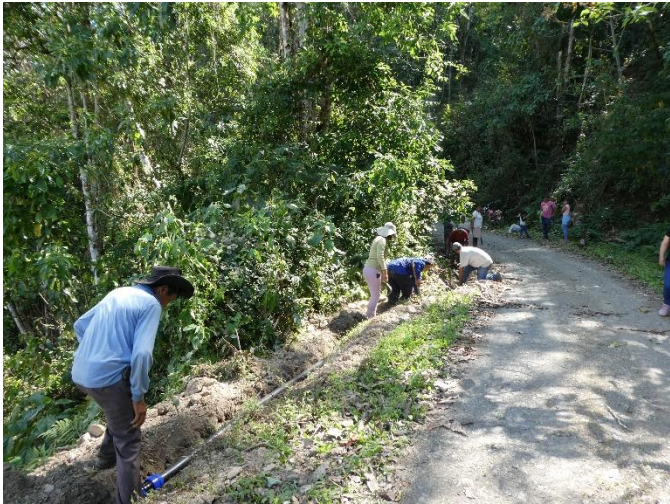
The water pipes were buried underground to protect them from damage.