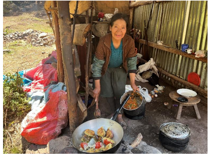
The grandmother of the family cooking during our visit.