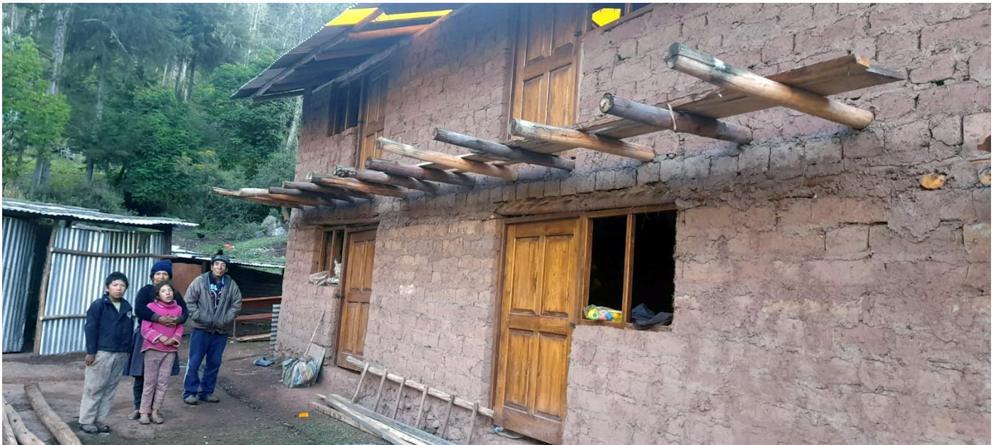
The new home is 80% complete, only the windows are required. Visible in the background is the tin shack in which the four members of the family lived, in cramped conditions, for five years.