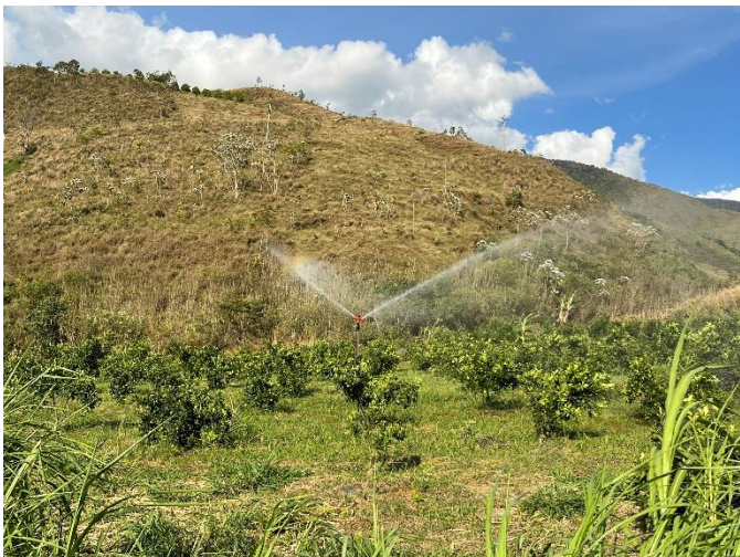
A sprinkler system irrigates various citrus trees.